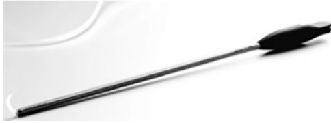
Figure 1. Platelet-rich fibrin delivery application device.