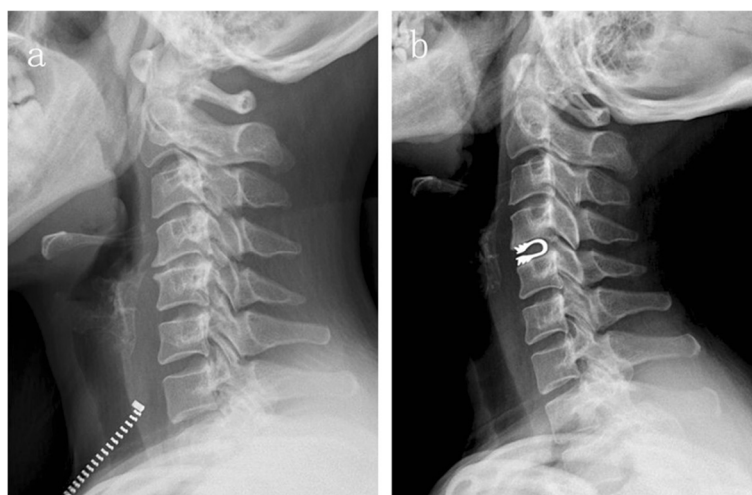
Figure 2 Preoperation and postoperation of DCI. a Preoperative lateral X-rays showed the height of C4-5 decreased, and kyphosis existed. b Postoperative lateral X-rays showed the kyphotic curvature retrieved.